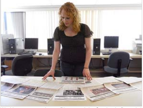
Working on a new issue.